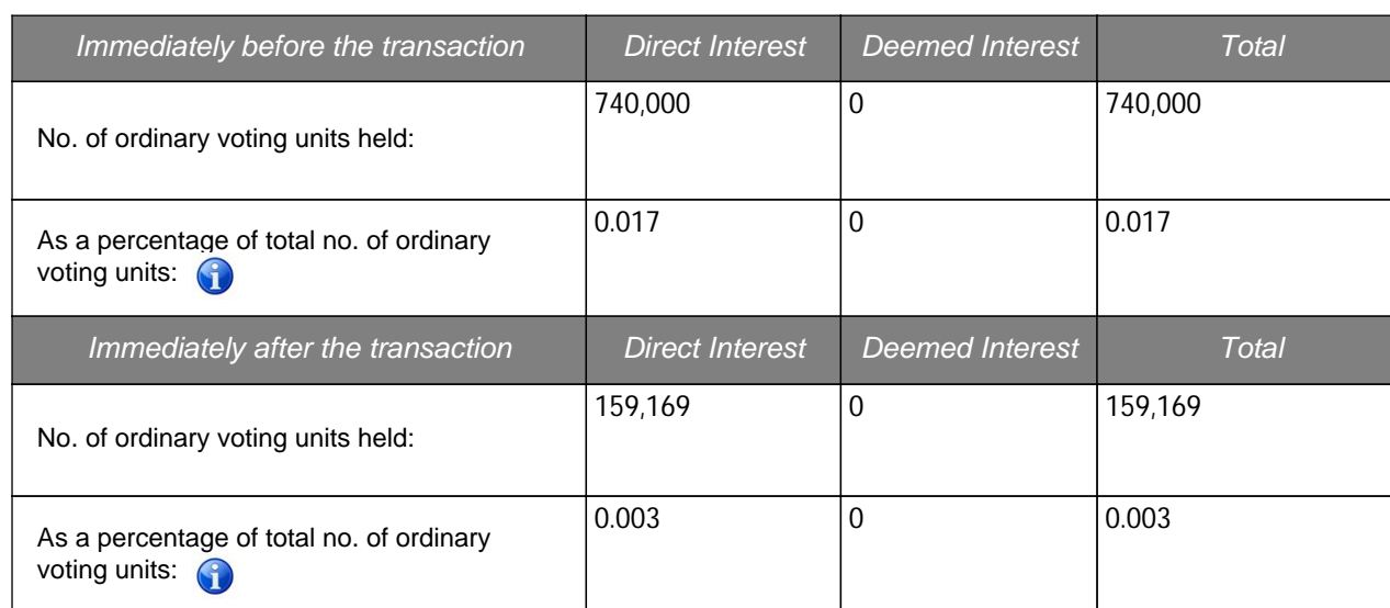
Table 1. Change in respect of ordinary voting units of Listed Issuer