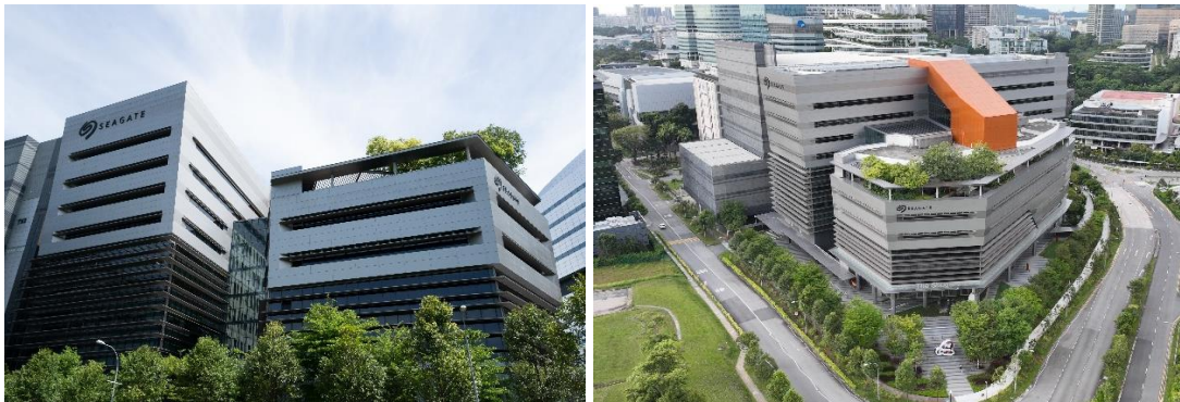
Location of the Property: